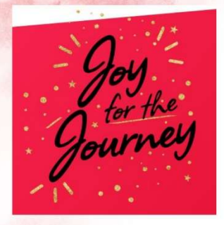
There is no charge for the event. There will be a love offering taken that will go to the speaker.

New Home Baptist Church 405 E Hampton Springs Ave Perry, FL 32347 850-584-7441 www.nhbcperry.com